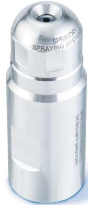
SB Series SprayDry® Nozzles