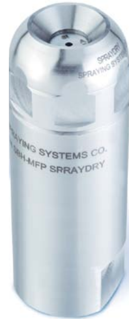
SK Series SprayDry® Nozzles