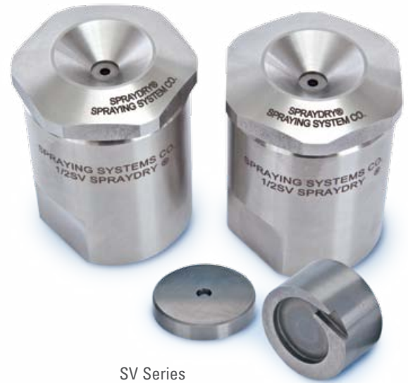
SV Series SprayDry® Nozzles